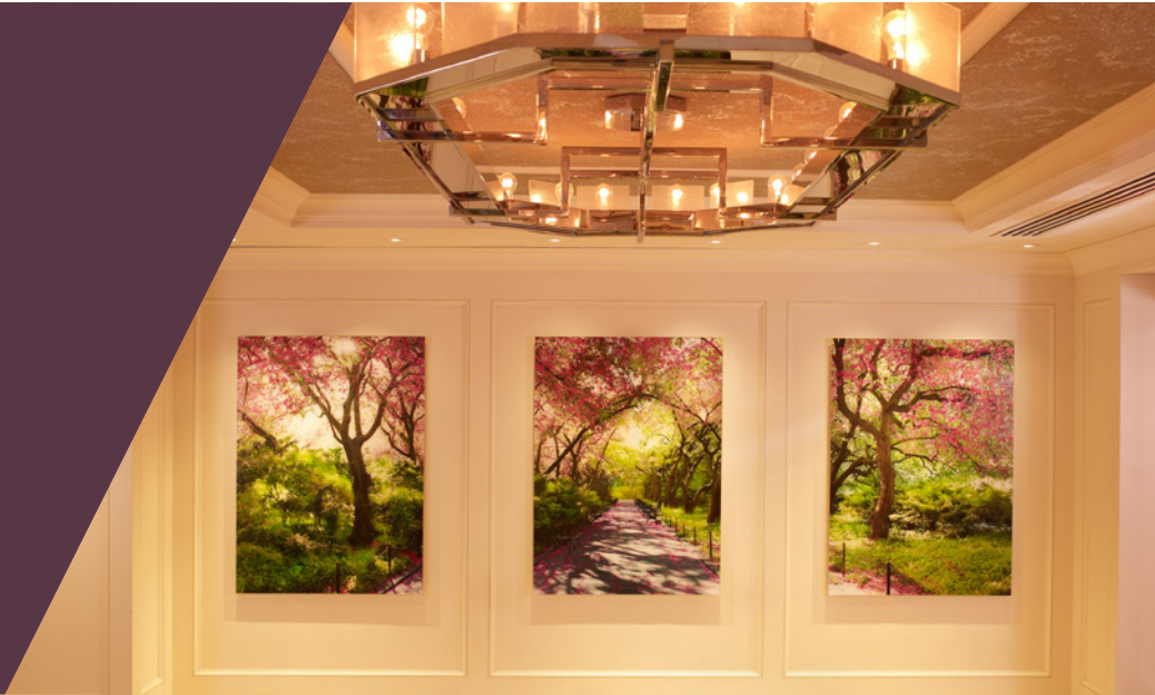
GRAND BALLROOM (BALLROOM & FORUM)